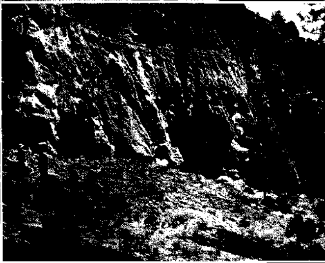
Old Governors' Palace at Santa Fé, New Mexico Cave dwellings in Frijoles Canyon

Hopi pueblos look out upon the desert plain from their mesa eyries. Here, too, are the hogans of the nomadic Navajos, the mud huts of the Havasupais, Wallapais, and Mojaves; also are seen the Apaches Pimas, Maricopas, and Papagos along the Salt and Gila rivers, in their wickiups and teepees. All of these tribes are civilized, and earn their living from flocks and herds or by cultivating the soil. They retain many of their primitive customs and modes of dress. On festal days it is as though the onlooker were transported to the remote past, so strange are the fascinating ceremonies.